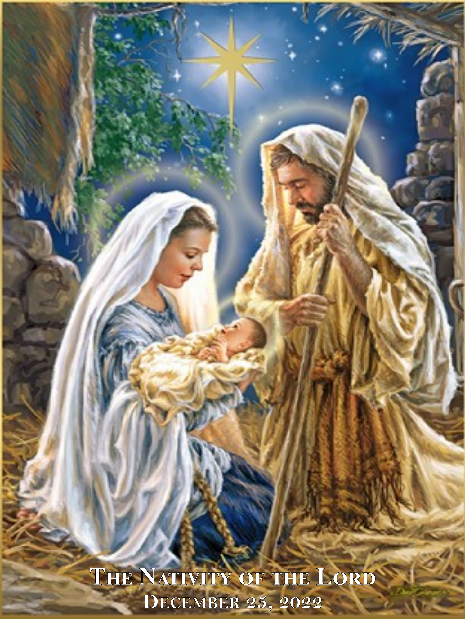
THE NATIVITY OF THE LORD DECEMBER 25, 2022